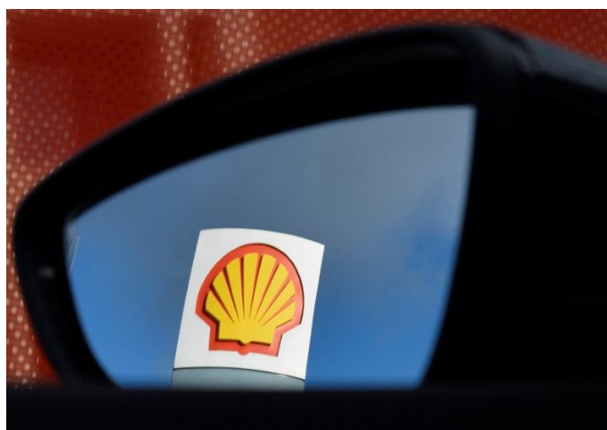
A Shell logo is seen reflected in a car's side mirror at a petrol station in west London, Britain, January 29, 2015.