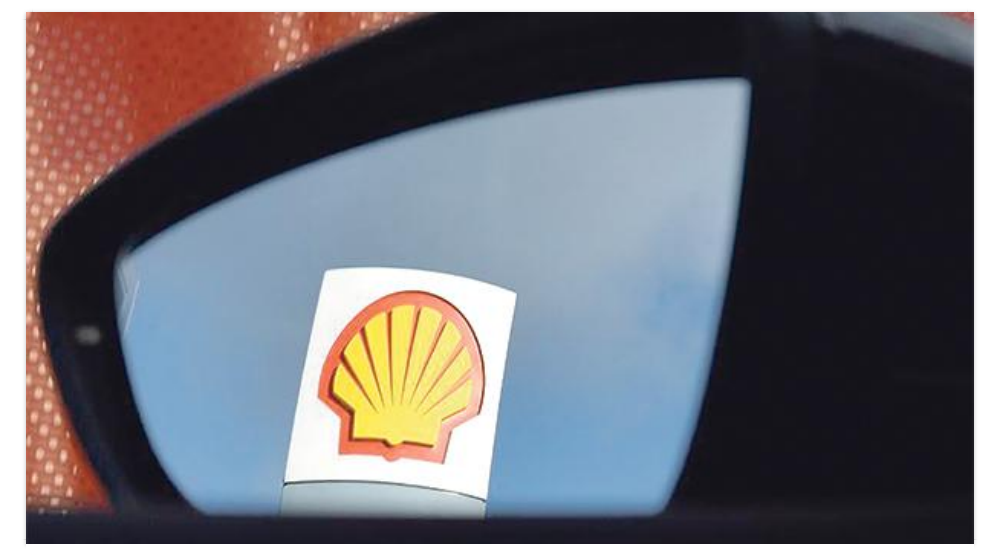
A Shell logo reflected in a car's side mirror.

Royal Dutch Shell plc plans to cut more than 400 jobs in the Netherlands, mainly at its major projects and energy technology operations, as the oil giant shifts its business model in response to lower oil prices, according to an internal document seen by Reuters.