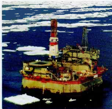
Part of the Sakhalin island project

In the mid-1990s, when Shell signed the contract, the oil price was low and Russia was on its knees financially. Moscow needed the expertise Shell offered. But by the time Shell was announcing a doubling of costs on Sakhalin, President Putin was rather less respectful of foreign energy companies. The cost increase—which post-